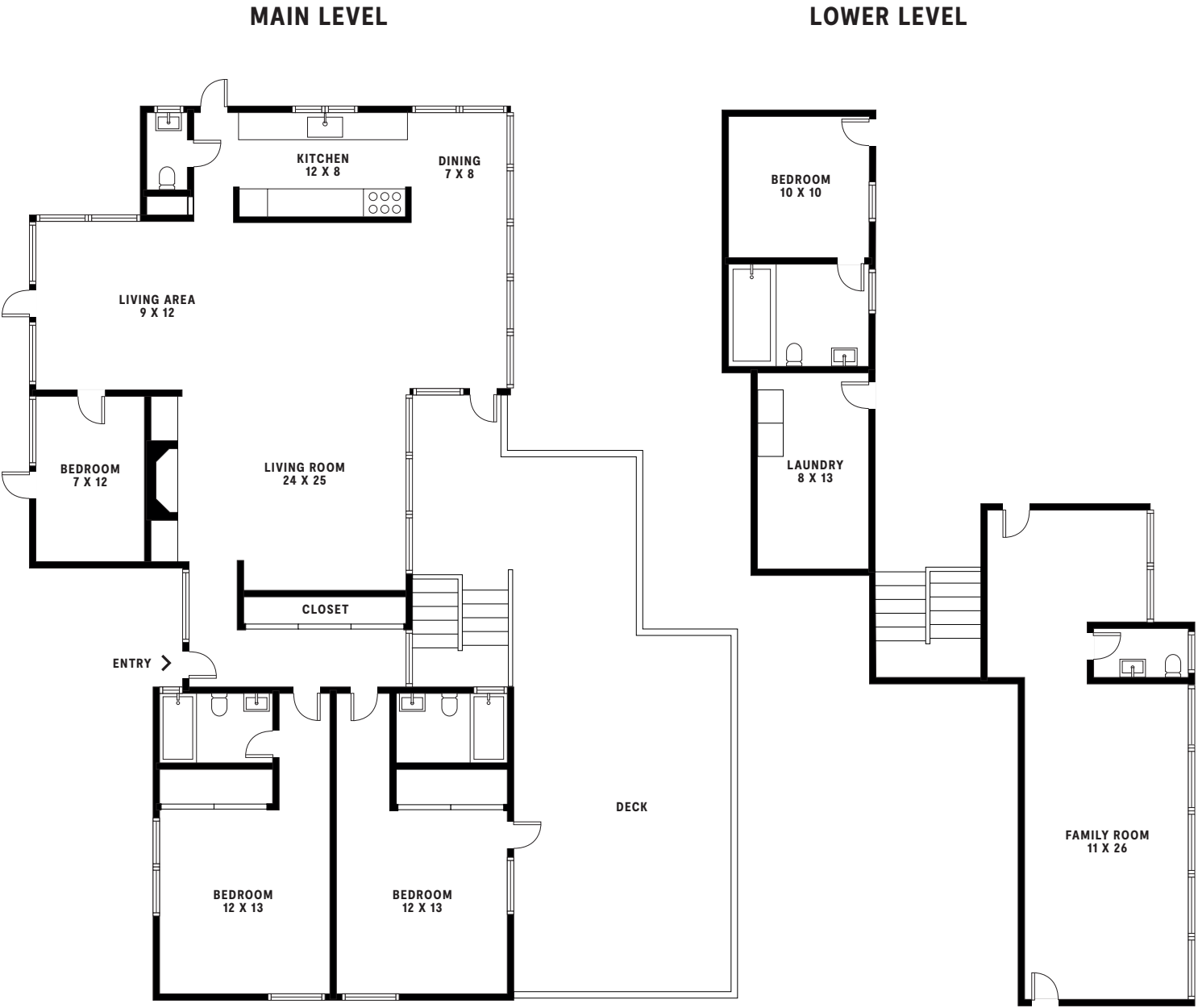
HOUSE C.2438 SF / LOT 9,348 SF